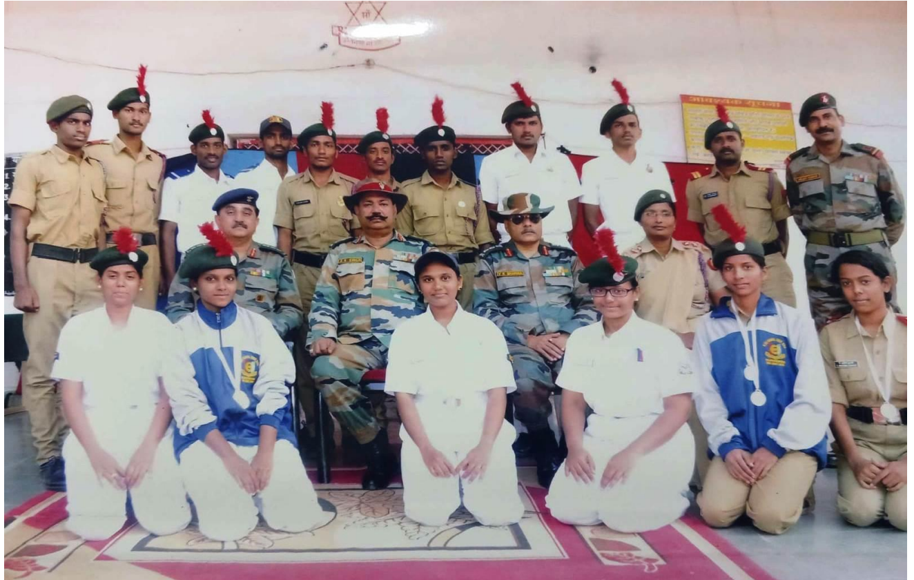
NIC CAMP AT MAIHAR