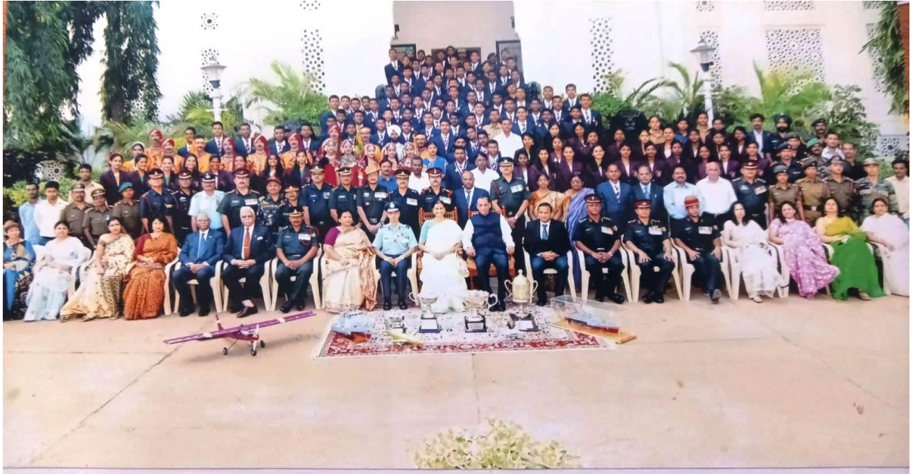
GROUP PHOTO IN RDC 2013